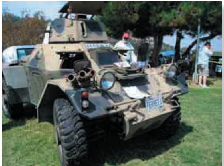
...and of course a Ferret armored car...