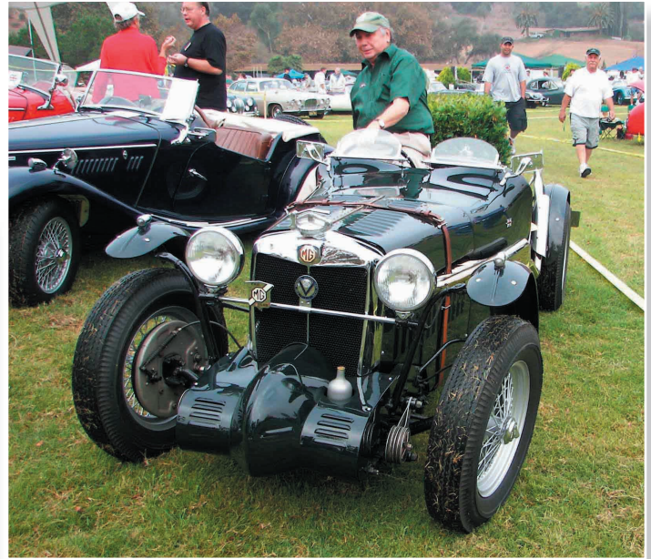
...and we end this British Car Day with an outstanding supercharged BRG MG type NT.