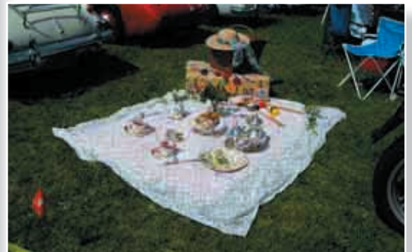
...a proper picnic eaten off porcelain...