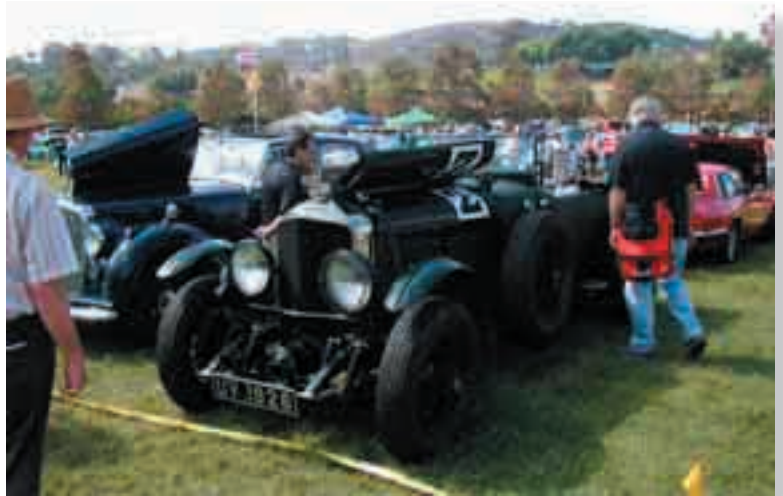
...not to mention a brace of Logondas and blower Bentleys?...

Trophies were awarded to all the marques and for the Best Classic Elegant Picnic. The Best of Show was awarded to a Rolls Royce Phantom VI limo that had beautiful picnic side boards attached to the front wings with an appropriate picnic including crystal wine glasses and padded seats that were attached to the bumper over-riders. The family that brought the 1929 Bentley Speed Six also brought the 2 Lagonda's "he" drove the Speed Six and "she" drove the V12 Lagonda Rapide. In the line up of Austin Healey 3000's, one that was extremely well turned out was