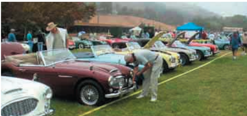
...a long line of Austin Healeys, one had by it's owner since new...