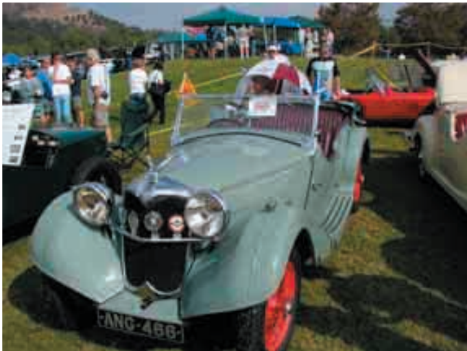
...a well badged, quiet colored Sunbeam tourer...

bought new in 1963 by its present owner. The day was a perfect Southern California Fall day with the temperature being just right. The picnics were all enjoyed; the food and souvenir vendors did a great business. The volunteers started to clean up the field about 3.00 pm so as to leave it the same way it was on arrival.