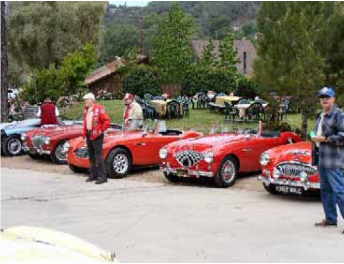
Some of the cars at Old Creek Ranch Winery