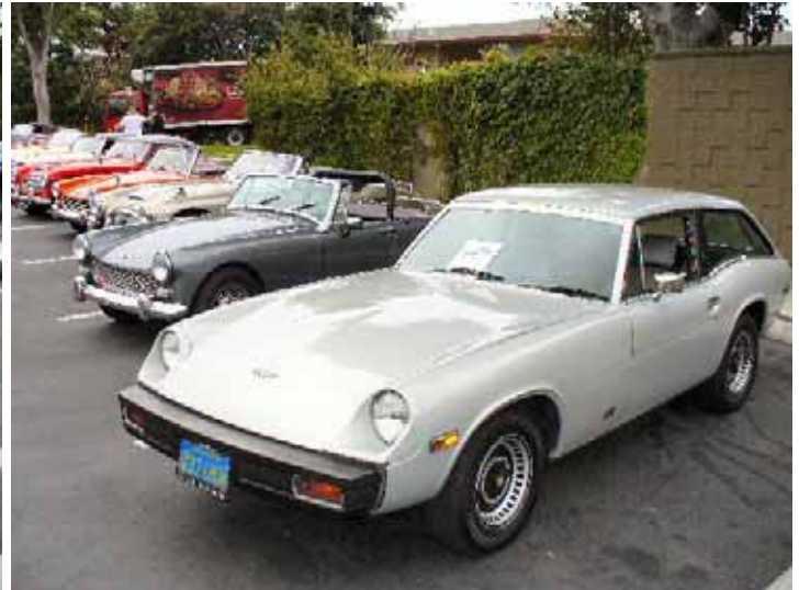
Dana McPeck's Jensen GT & Rick Snover's Sprite

Friday morning we all enjoyed a very nice breakfast at the hotel then jumped in the Healeys for a pleasurable drive up into the mountains to do lunch and some wine tasting. As we arrived at the Old Creek Ranch Winery, we were greeted by two big ol' shaggy, four-legged car lovers running alongside us enjoying the view from ground level. The winery owners had a nice little outdoor tasting table set-up for us, and some picnic tables in the grass under a huge oak tree for our box lunches. There were a lot of great photo opportunities in this picturesque setting. After lunch, most of the group continued on up the hill through Ojai for a tour of the California Oil Museum in Santa Paula. There you received the complete history of petroleum products... I know what that sounds like, but those attending were very impressed by the museum's displays. Dana & I had decided instead to drive up the coast for a couple hours towards the Big Sur area, but had to turn around due to Dana's not feeling well.