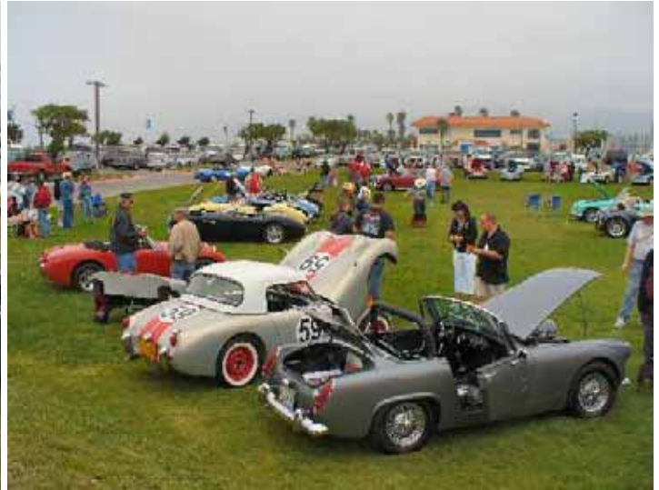
Car Show at Ventura Harbor Marina