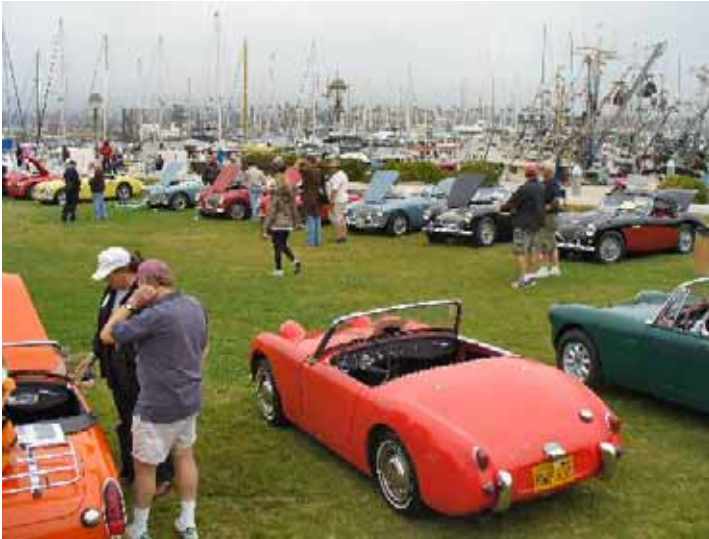
Car Show at Ventura Harbor Marina