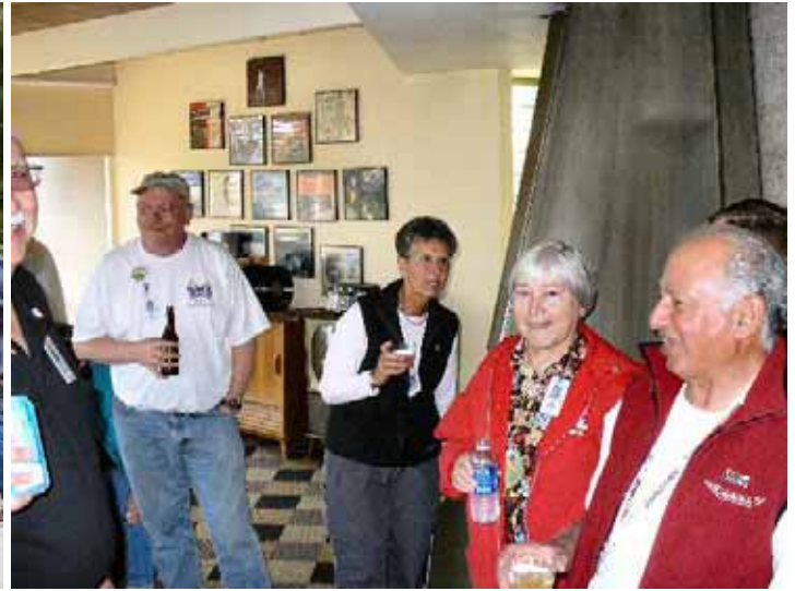
AHCS at one of the "50's Flat" parties