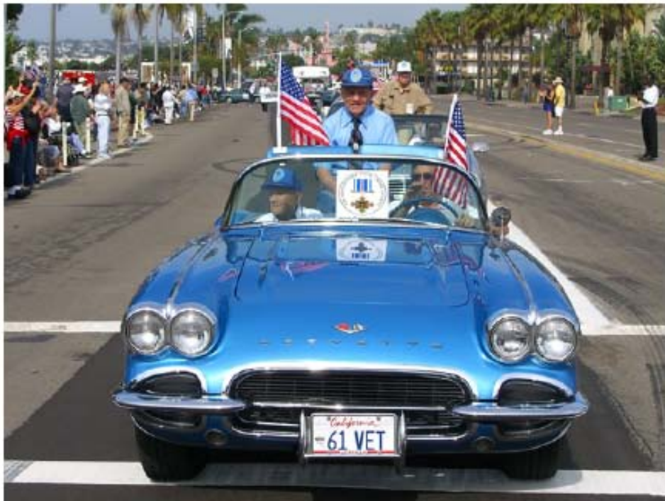
2006 Veterans Day Parade

Each year, on the appointed day, and at the specified time, San Diegans pause to honor our Nations' Veterans, by participating in or observing the Parade in San Diego. This Parade includes entries from across San Diego County, composed of Honor and Color Guards, JROTC Drill Units, Military and High School Marching Bands, Military units and vehicles, Veterans Organizations, and of course, Dignitaries.