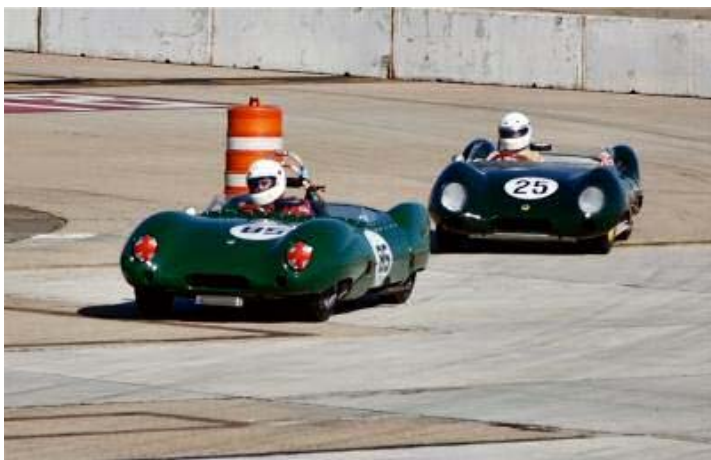
'57 Lotus Eleven & '59 Lotus Eleven