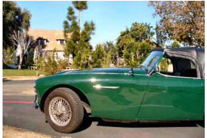
Terry Cowan's 100 at Briar Rose Winery