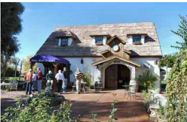
Briar Rose Winery