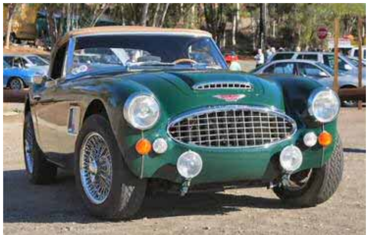
Warren Voth's 3000 at Deer Springs Park & Ride