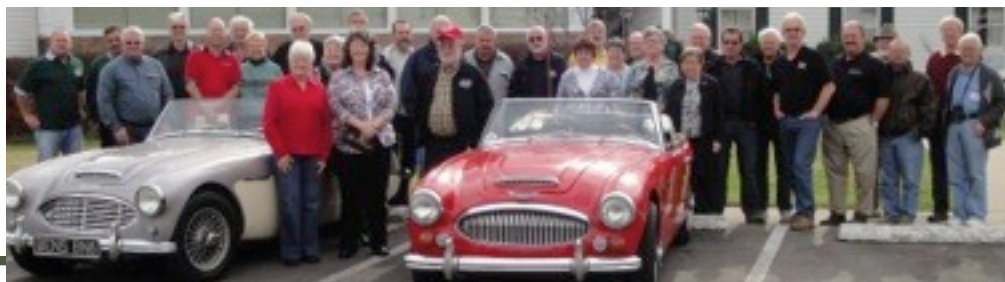
HEALEY 15 HEARSAY