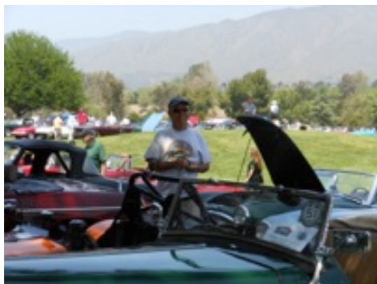
Pauma Valley Country Club