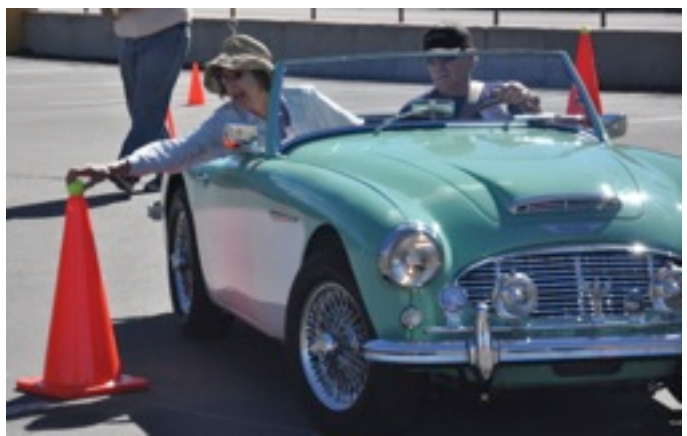
Continued on Page 9

There were radio-controlled car races using