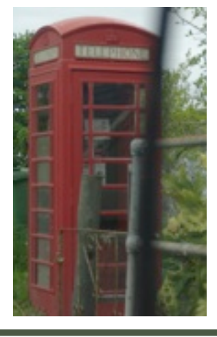
HEALEY 7 HEARSAY