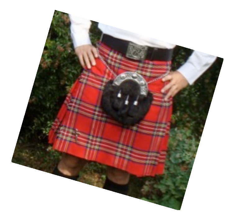
April 19 -- Rolling British Car Day at the Pauma Valley Country Club.

Dec. 31 – English New Year (You'll have to figure out when 12 o'clock is in England) at the Tilted Kilt.