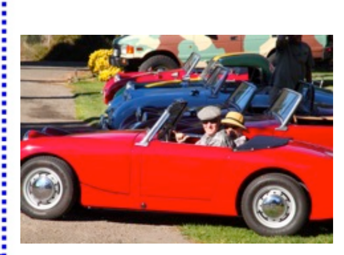
Bug Eye Bar-B-Q