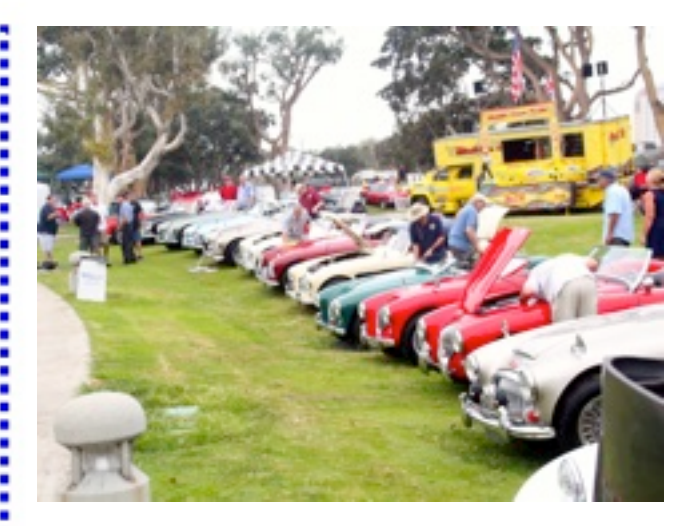
Brítísh Car Day

Drive your HEALEY safer and with more confidence!