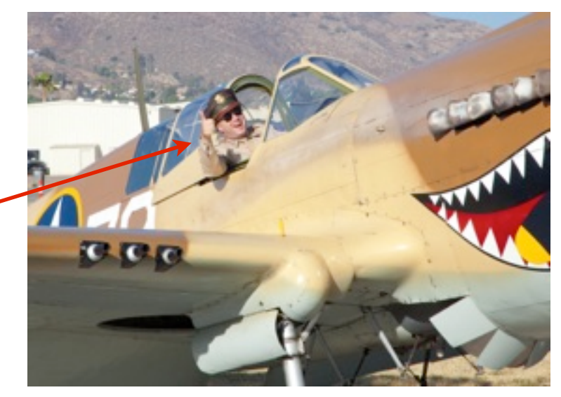
HEALEY 4 HEARSAY

Respectfully submitted Dick Schmidt, secretary