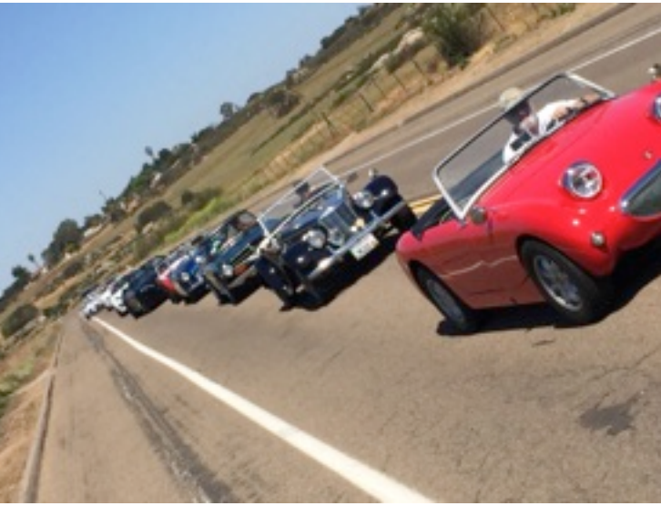
HEALEY 9 HEARSAY