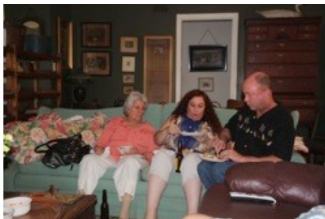
Enjoying a fun afternoon at the Superbowl Party in Point Loma

Drive your HEALEY safer and with more confidence!