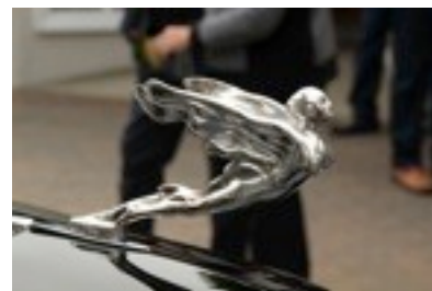
Classic ornaments seen on Ocean Blvd. in Carmel.