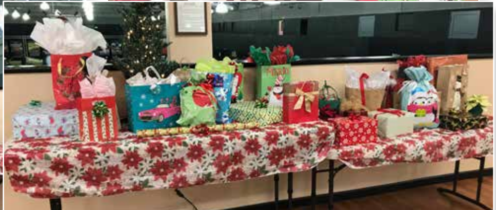
The Christmas gift table before the gift drawing begins...