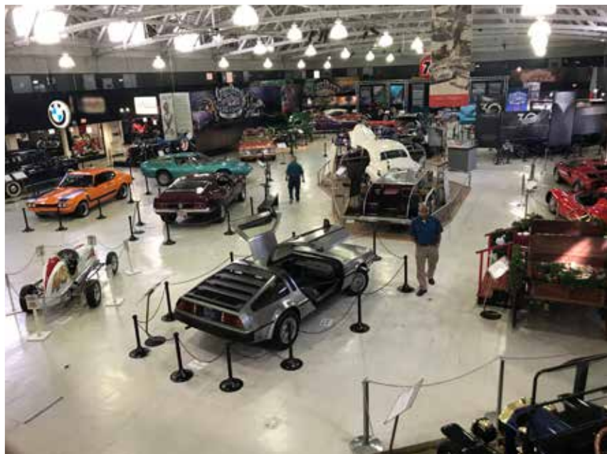
The gull-wing DeLorean eternally chasing Louie Matar's non-stop Cadillac and support trailer, back to the future.