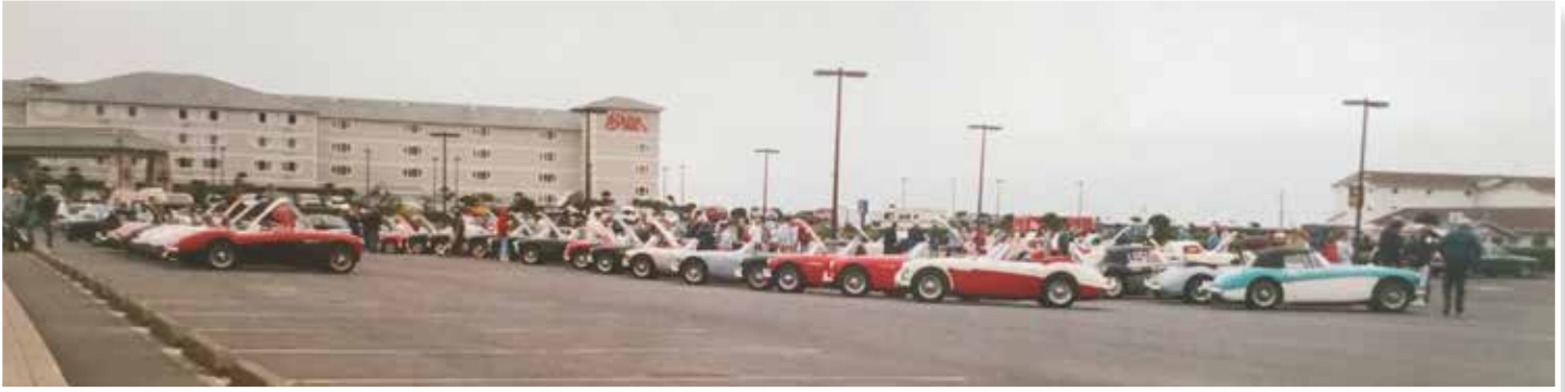
The Shilo Inn at Ocean Shores Oregon and Rendezvous 2000.