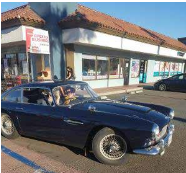
Must be James Bond and girl friend heading out for a rendezvous somewhere...