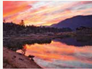
Sunset over Big Bear Lake

Knot Avenue, the main drag in Big Bear where we will wow the tourists with our dazzling cars. Late afternoon will see the finals of Rocker Cover Racing followed by a no-host Cocktail Party in the Social Center and more Paddlewheel Boat Touring .