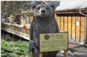
Big Bear Zoo

Check-in , time for a Car Wash (on site) or to relax in the Social Center. No host evening Cocktail Party with appetizers and a special Guest Speaker . Silent Auction, Arts and Crafts displays open. Dinner on your own at the hotel or one of the numerous nearby establishments.