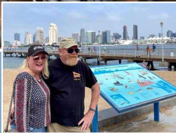
Above- Happy Club members doing what they do best...eat and drink at Peohe's Coronado.