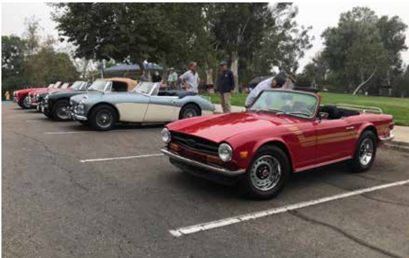
Left- The gang stretching their legs and having a snack and water at Otay Lakes County Park.