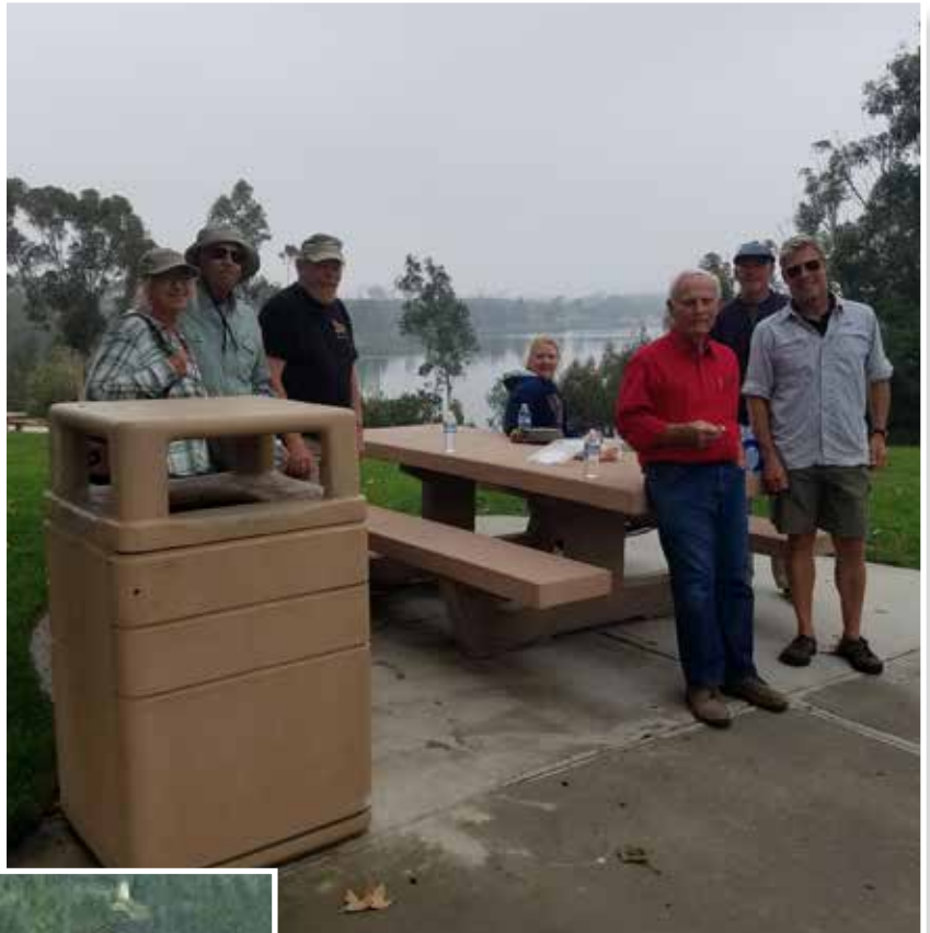
Above- The crew taking a break before heading out for the Strand and lunch. Below- Picking up our snack and departing Otay Lakes County Park. Left- On the road to Coronado on Orange Avnue to Peohe's Restaurant.