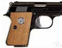
1908 Colt Junior Automatic

will find it useful to have handy - not for strictly personal use, but to occasionally hold up to see what is behind you. If you are going to drive alone on the highways and byways it