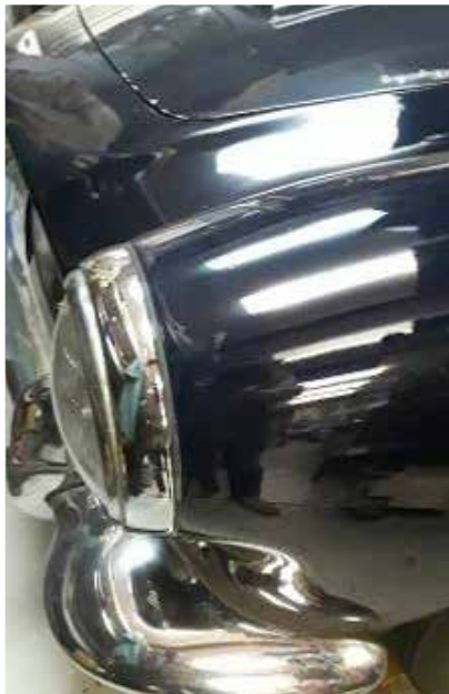
...the headlamp trim ring and crumpled the sheet metal directly behind the headlamp.