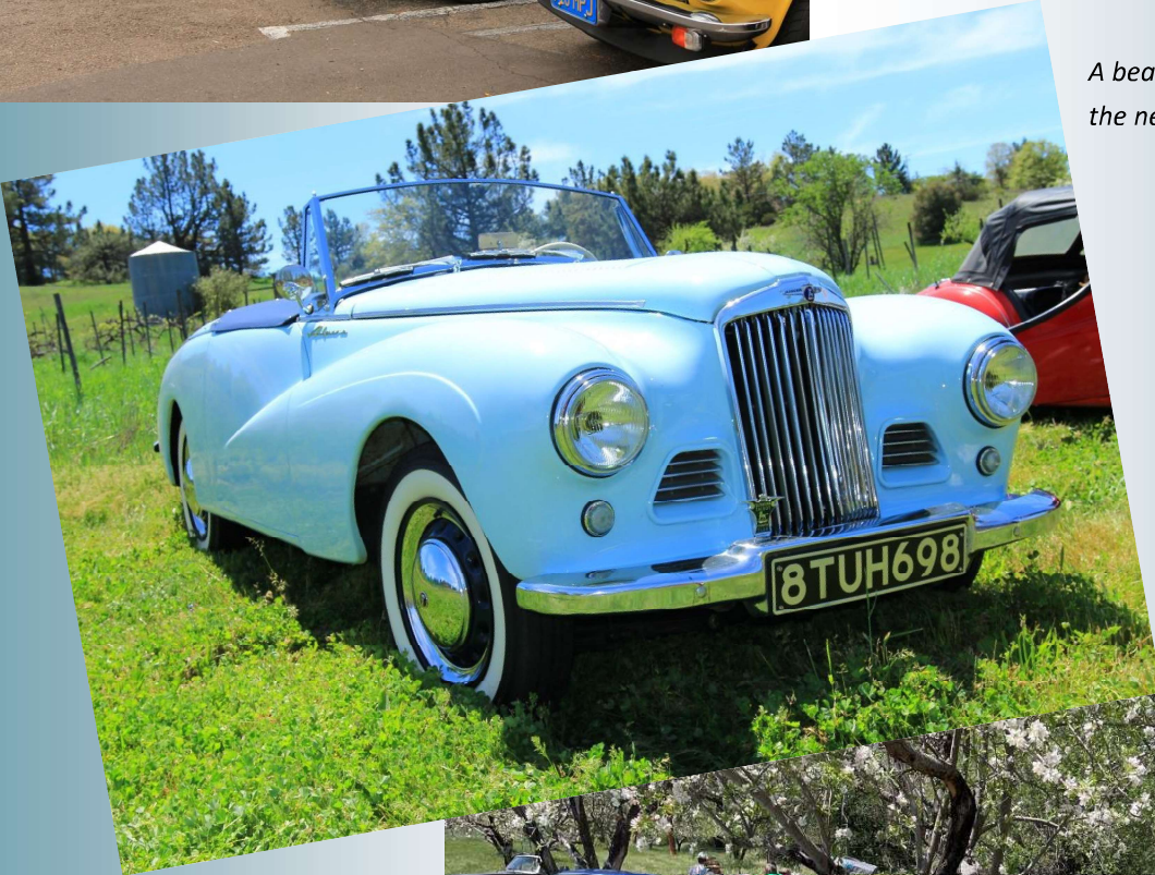
A beautiful Alpine Sunbeam, predecessor to the newer Sunbeam/Tigers.