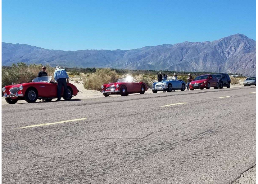
Above: The group at a viewing area.