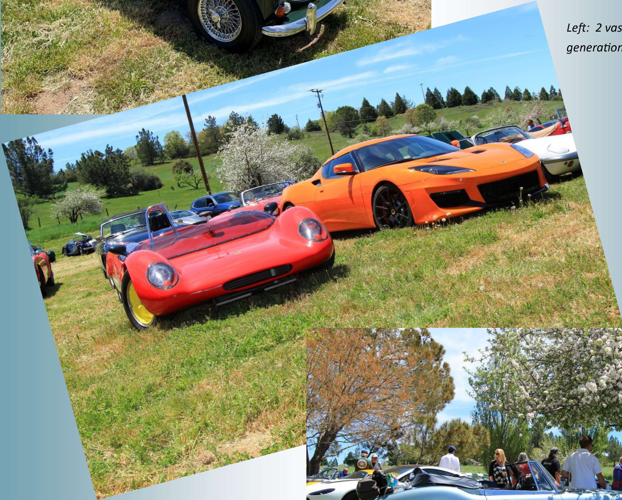
Left: 2 vastly different generations of Lotus.