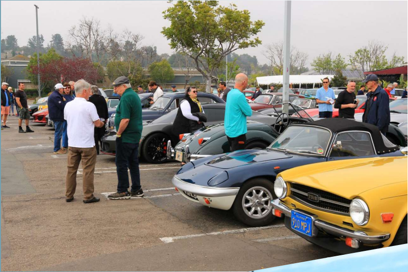
Left: Part of the "Northern contingent" in Carmel Mountain Ranch awaiting the command to fire engines and roll out.