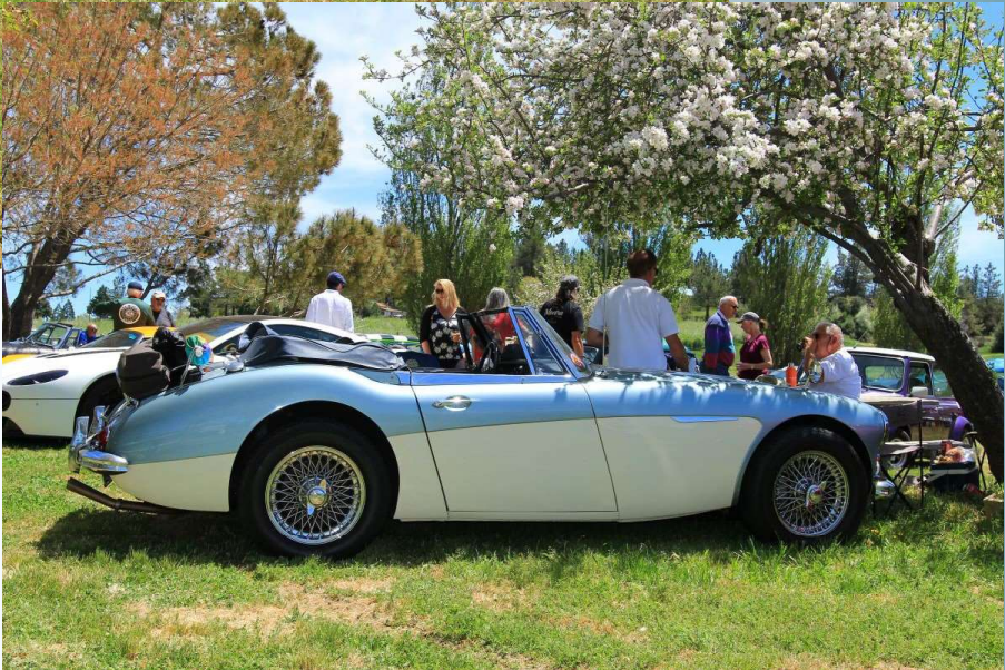
Right: Dave's BJ8 enjoying the shade of an apple tree, with the rest of us!