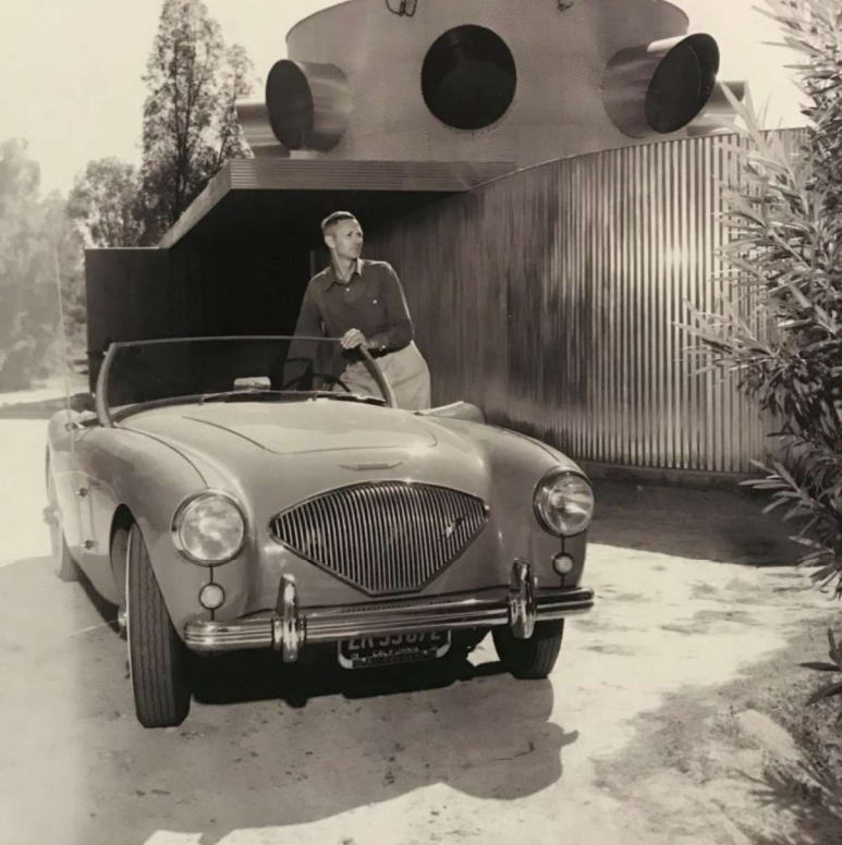
Albert Frey in front of his first Palm Springs home, Frey House 1 (circa 1953).