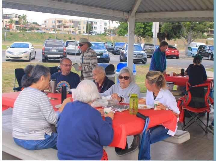
A group of folks enjoying breakfast and conversation.