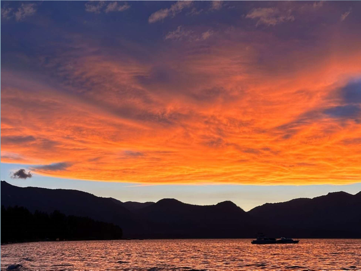
A beautiful ending to the day.