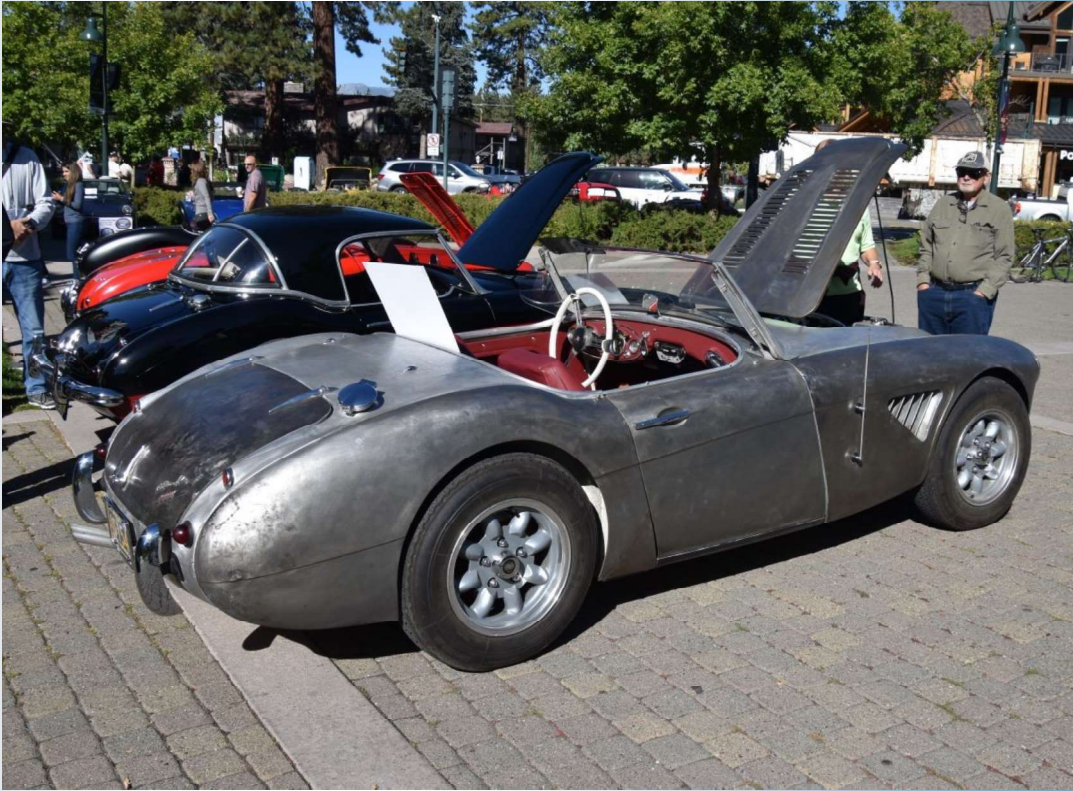
Gotta love a "Rat Rod"!