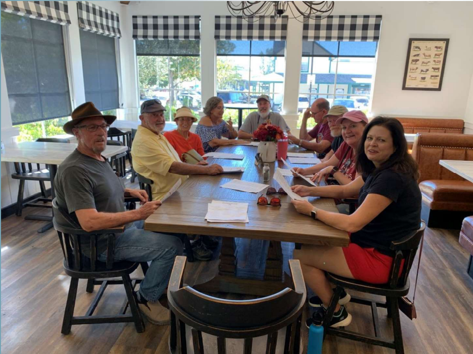
The Miners at Lunch.