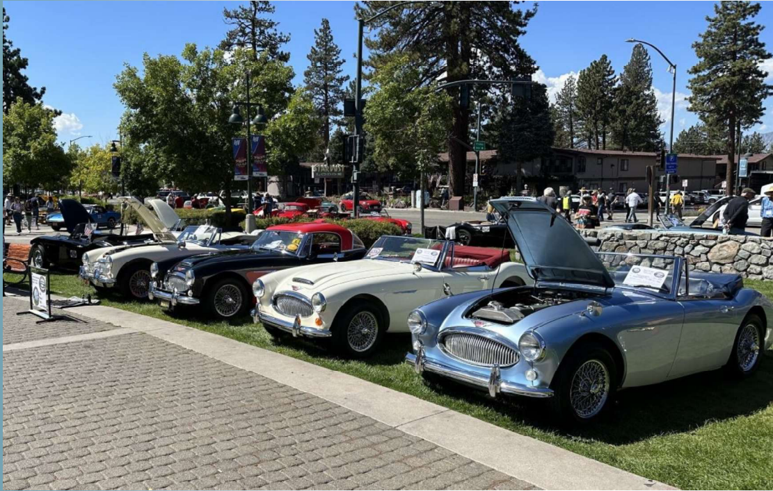
By the way, there were some Healeys there too!