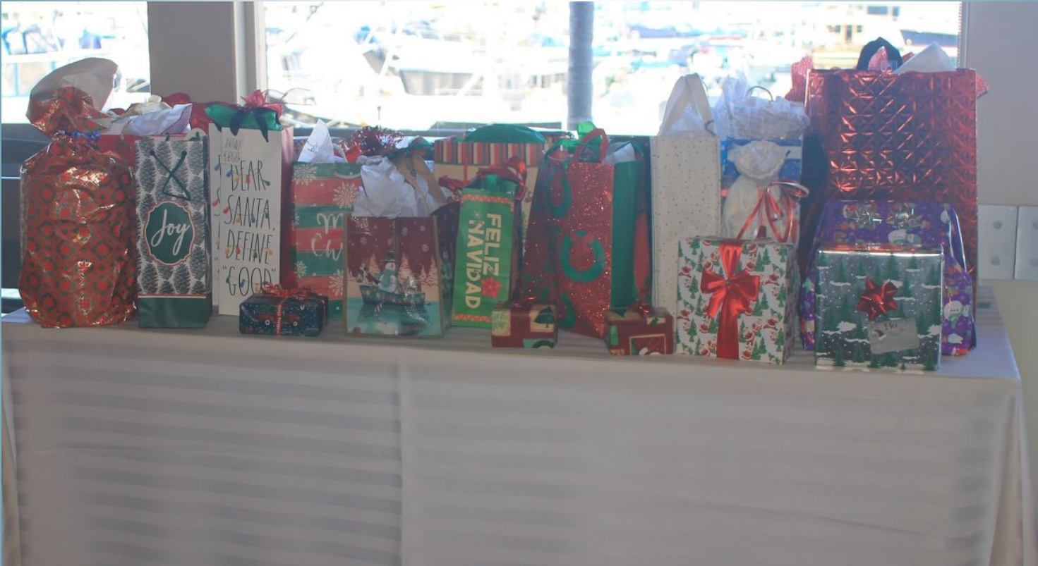
The gift table is ready for the fun to start.