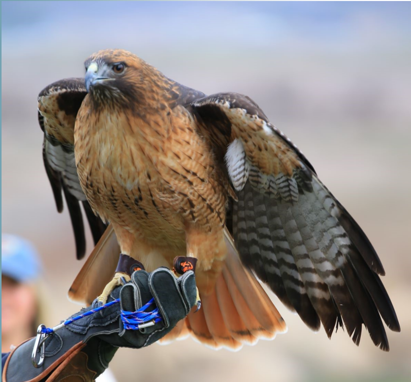
Above: A Red Tailed Hawk. Right: A Great Horned Owl