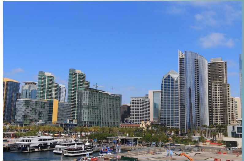
The San Diego skyline from the deck of the Midway.