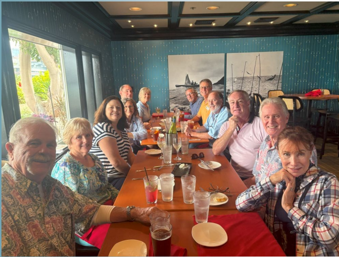
The gang at lunch at the Fish Market Restaurant.

What a great way to spend the day in San Diego.