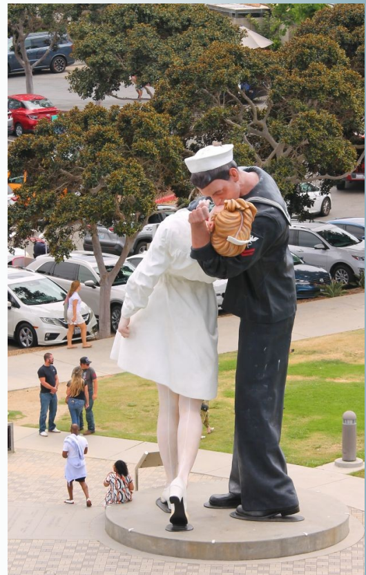
The statue of the famous "Kiss Photo" from the end of WWII.